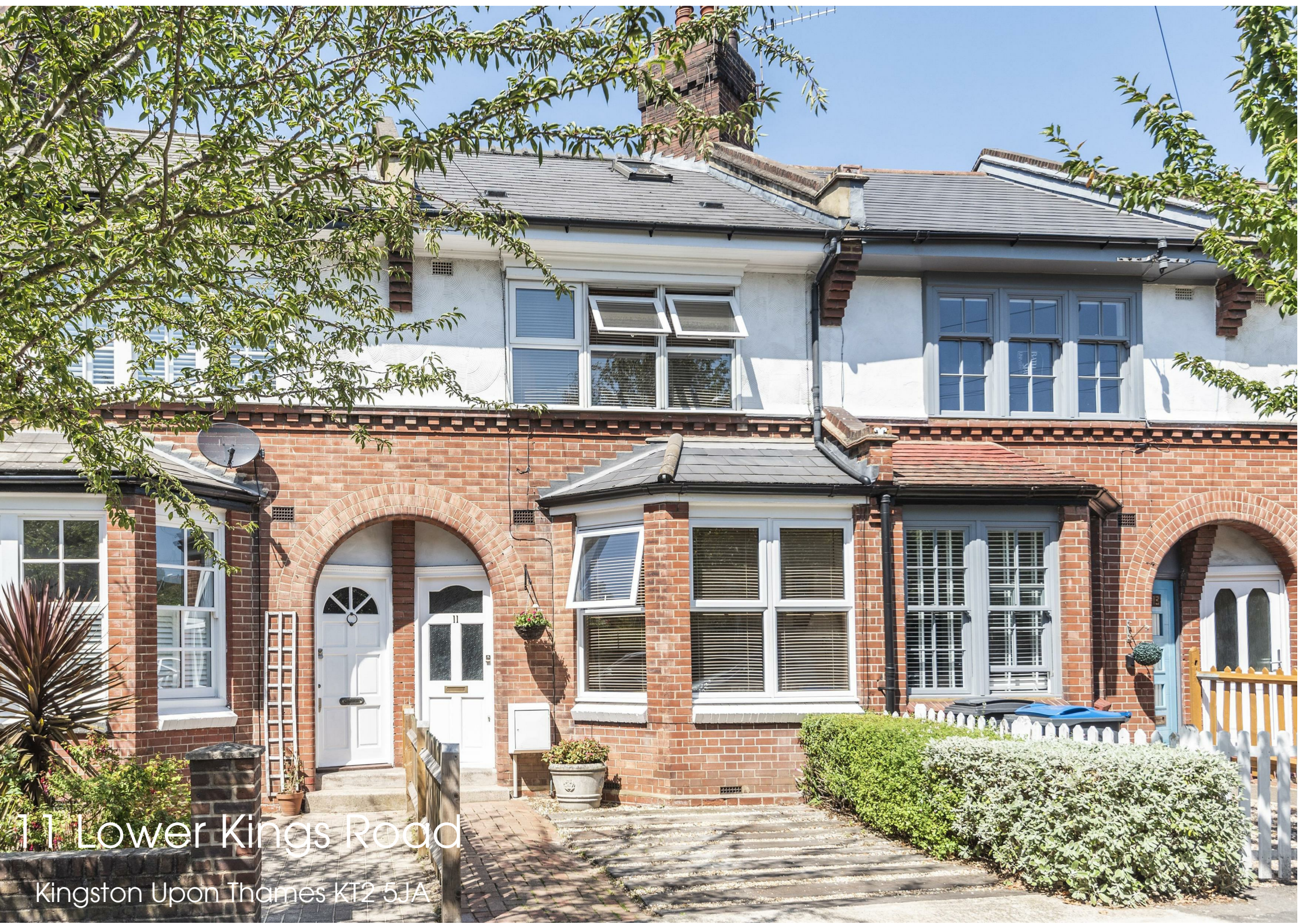
11 Lower Kings Road Kingston Upon Thames KT2 5JA